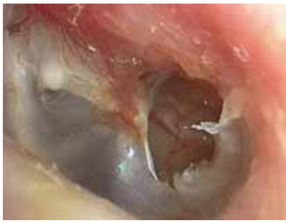
Figure 4 (above): Otoscopic view of a left ear with a marginal (unsafe) perforation. Note the perforation extending to the annulus of the tympanic membrane and also inferiorly, the white squamous epithelium migrating into the middle ear.