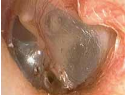
Figure 5 (above): Otoscopic view of a left ear with a marginal (unsafe) perforation. If untreated, a cholesteatoma may develop in this ear.