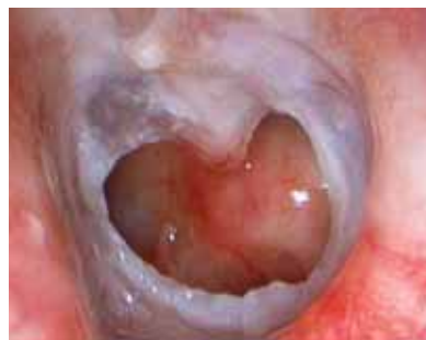
Figure 1 (left): Otoscopic view of a left ear with a central perforation. The ear is inflamed and moist.